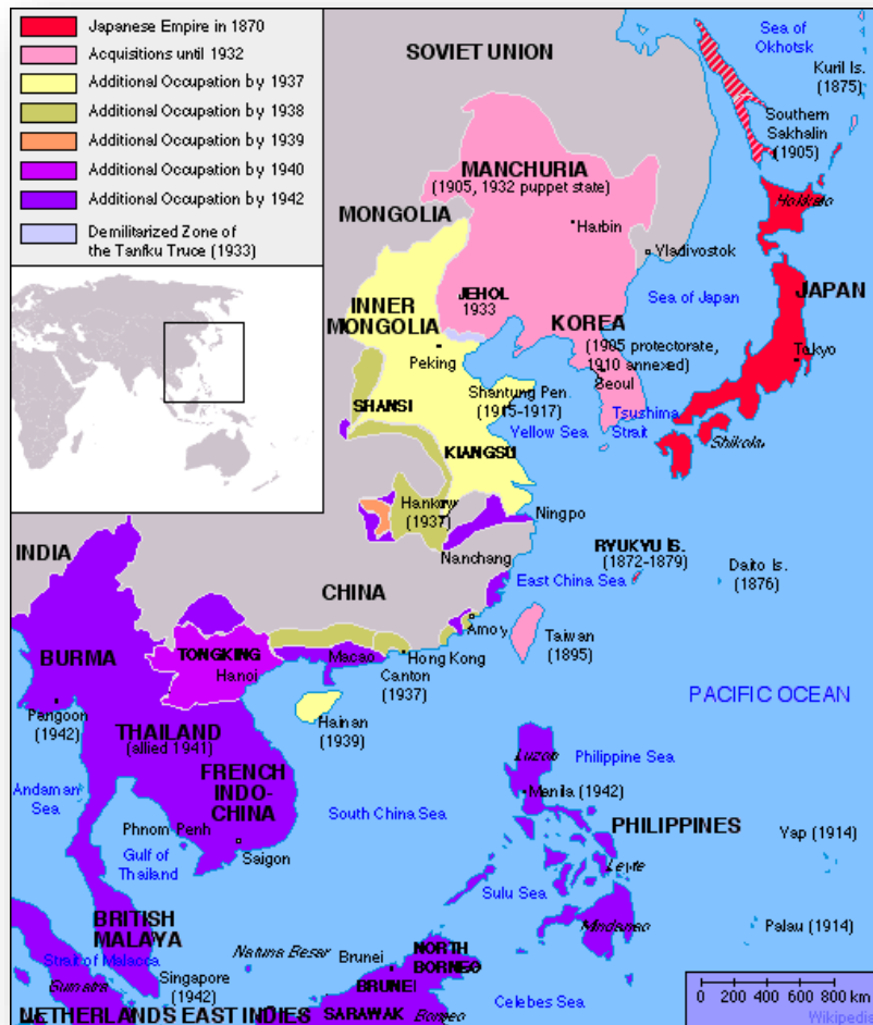
Secondary Source: Map

This map shows the extent of Japan's territorial expansion before and during World War II. Japan also took control of the islands of Micronesia.