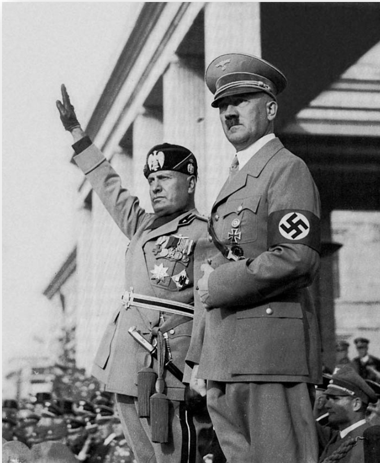
Primary Source: Photograph

开支。沃伦·G·哈丁总统的政府参加了1921年和1922年的华盛顿海军会议，该会议减少了九个签署国海军的规模。此外，1921年由美国、英国、法国和日本签署的“四权条约”承诺签署国不得在亚洲进行任何领土扩张。1928年，美国和其他14个国家签署了凯洛格 - 布里安条约，宣布战争为国际罪行。尽管希望这种协议能够导致一个更加和平的世界，但他们失败了，因为没有一个国家承诺任何国家在违反条约的情况下采取行动。