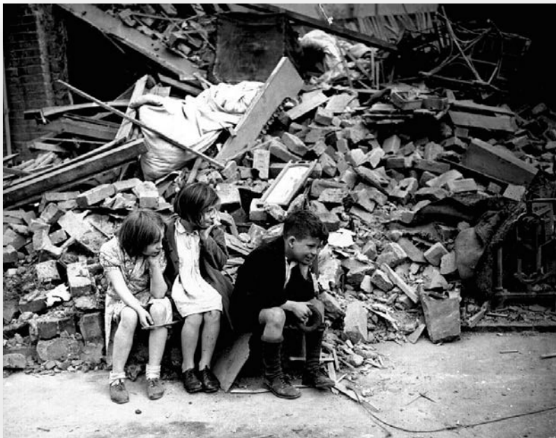
Primary Source: Photograph

1941 年 3 月，对英国自卫能力的担忧也影响了国会批准 Lend Lease 的政策，这种做法可以让美国出售，出租或转让武器到任何被认为对美国保卫重要的国家。罗斯福公开沉思说，如果一个邻居的房子着火，没有人会卖给他一条软管来把它拿出去。常识决定软管借给邻居并在火熄灭时返回。美国可以简单地向英国提供打击战争所需的材料。战争结束后，他们将被遣返。国会对该提案进行了热烈的争论。参议员罗伯特塔夫特反驳道，“借出战争装备是一件好事，就像借口香糖一样。你不希望它回来。”最后，国会批准了这项提议，有效地终止了不干涉政策，并解散了美国成为中立国的借口。该计划从 1941 年开始到 1945 年，并向英国，苏联，中国和其他盟国分发了价值 450 亿美元的武器和物资。